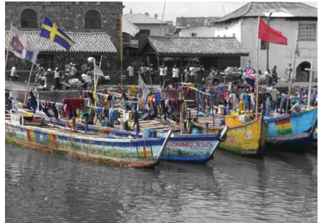
Plexus Journal 2013 by Carter English